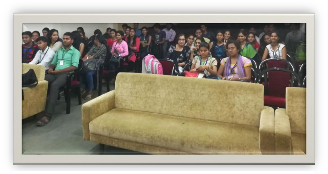
Students learning MS Excel in Skill Development Workshop