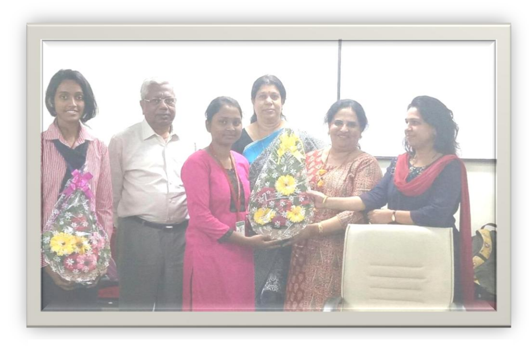
Felicitation of Secretary and Lady Representative of Students' Council