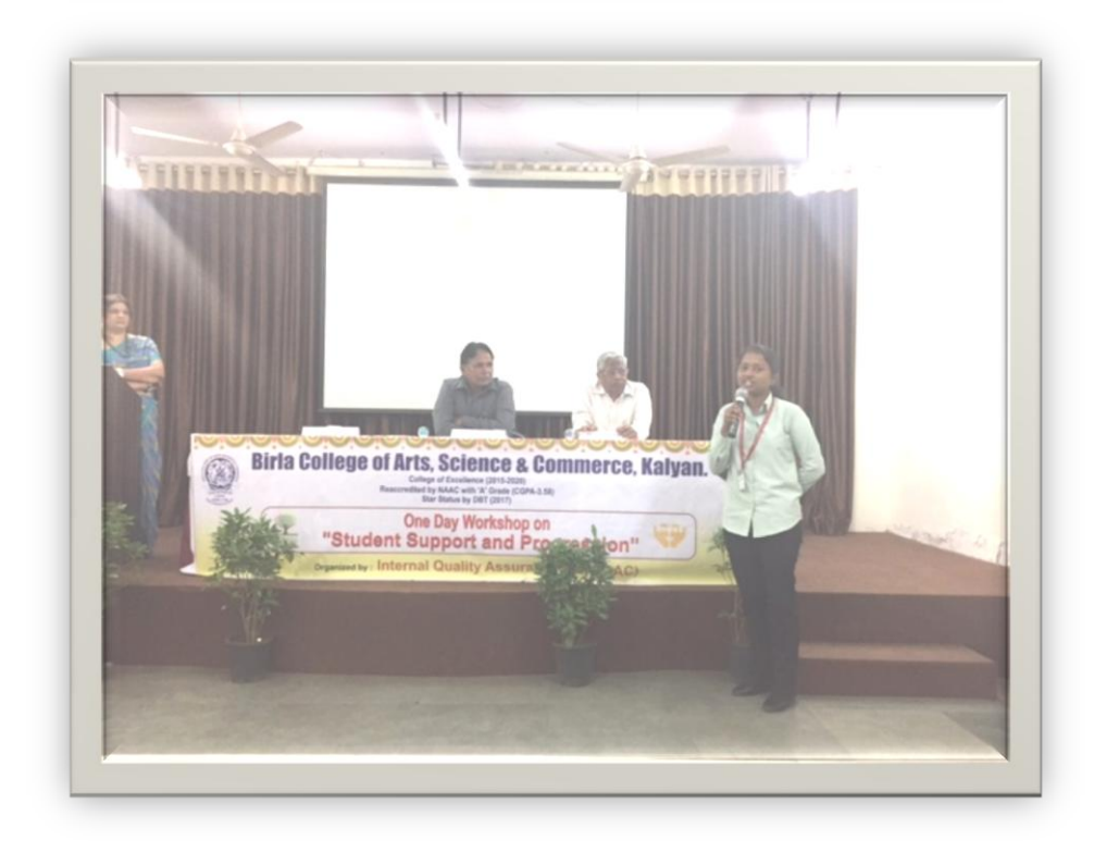
Program on Students Support and Progression