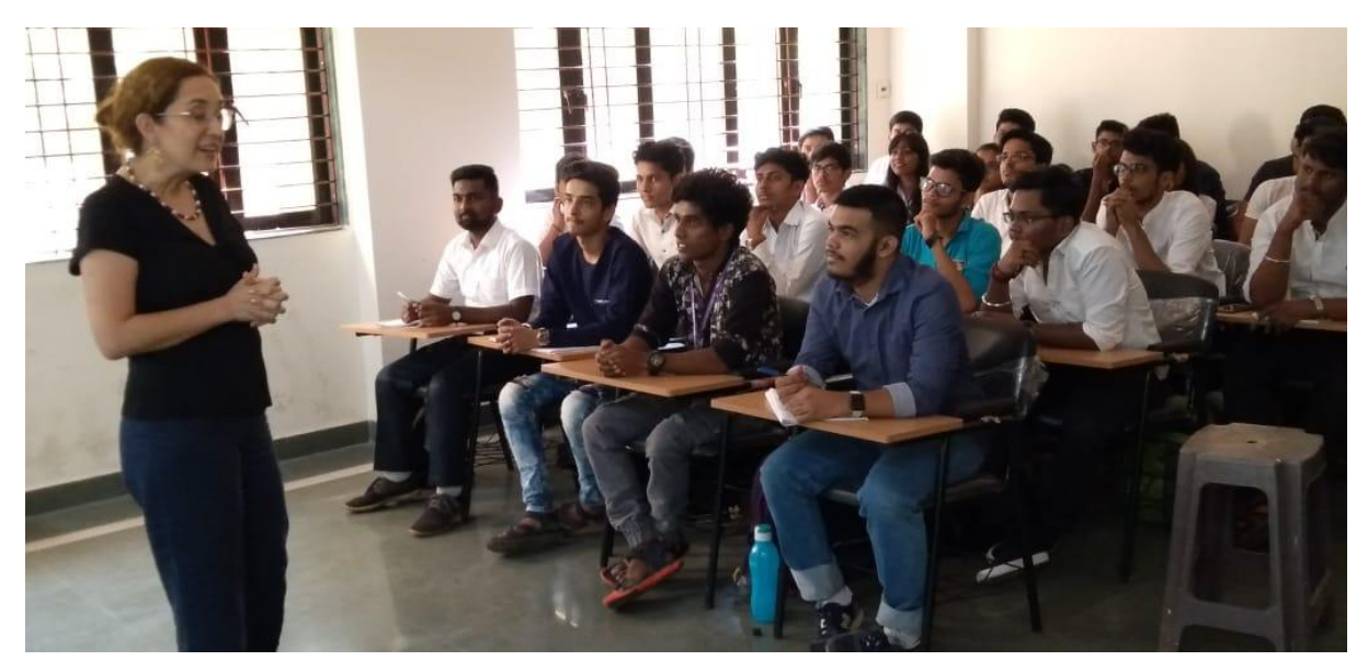
Students of Mass Media enhancing their knowledge on CSR Communication

The interactive session was attended by around 90 students of Mass Media.