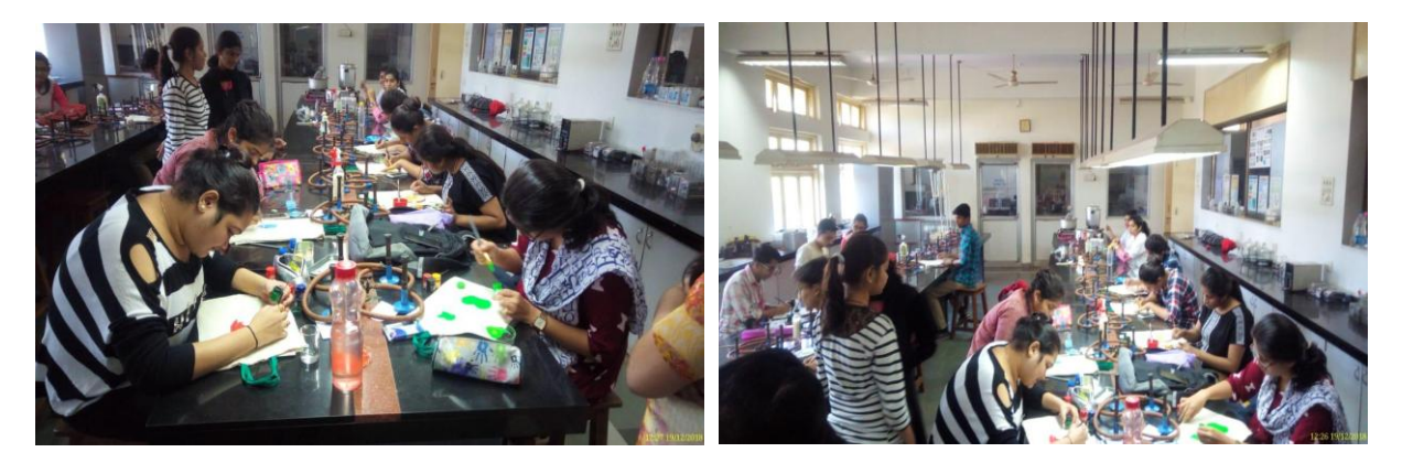
Students actively participating in Bag Painting competition held by Department of Biotechnology